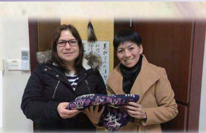
校長致送心意禮物給離職的外籍老師 The principal presents a specially selected gift to the resigned NET teacher