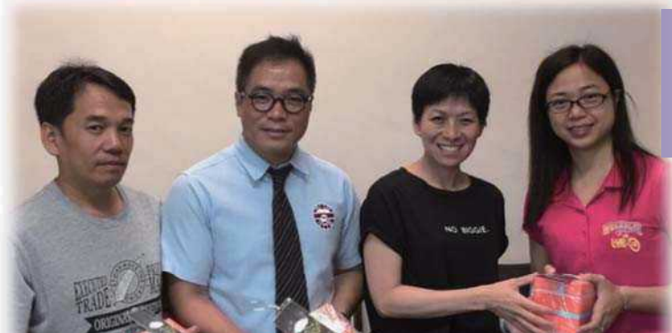
校長感謝沐靈堂對學校的支持 The principal thanks the support from the Abiding Spirit Lutheran Church