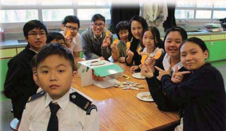
同學在團契中成長 Students grow in the fellowship